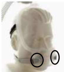
Figure 3: DreamWear Full Face Mask