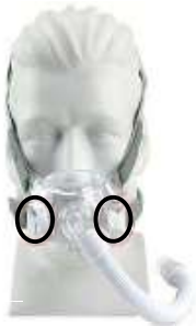
Figure 1: Amara View Full Face Mask

Figures 1 – 5 shows the images of the affected masks and Figure 6 (next page) contains their part numbers. The magnetic headgear clips on these masks are circled. Use the below images (Figures 1-5) and the Part Numbers (see Figure 6) in this letter, to determine if your or your patient's mask also uses magnetic headgear clips. These masks are intended to provide an interface for application of CPAP or bi-level therapy to patients.