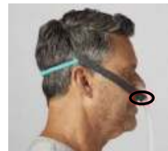
Figure 5: Therapy Mask 3100 NC/SP