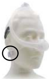
Figure 2: DreamWisp Nasal Mask