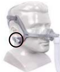
Figure 4: Wisp and Wisp Youth Nasal Mask